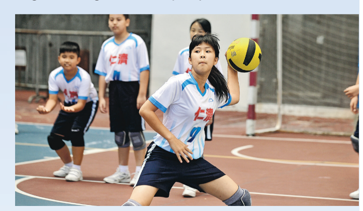
Ruby launched a ferocious attack!