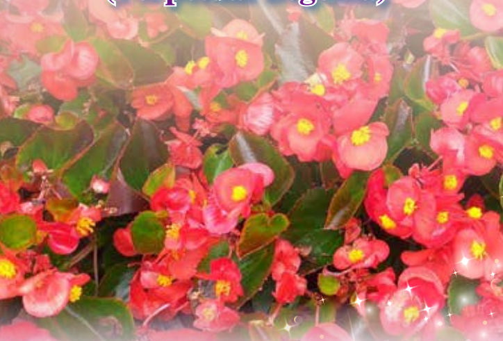
動物及園藝教育組 Zoological and Horticultural Education Unit

Begonia cucullata var. hookeri (Perpetual Begonia)